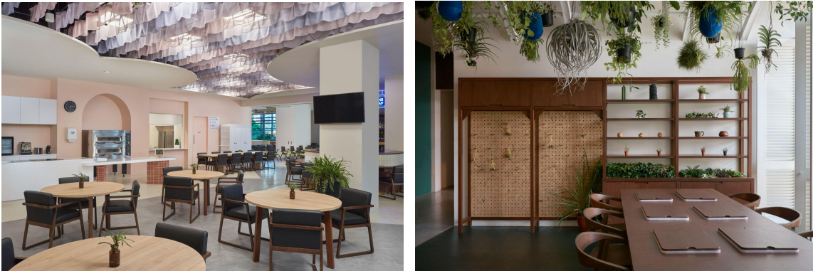
The dining room and conservatory at Oasis@Outram

Singapore, 1 December 2021 – HCA Hospice Care (HCA) has partnered Lien Foundation to launch a first-of-its-kind Day Hospice, Oasis@Outram , which redefines end-of-life caregiving to focus on the personal growth of not just patients but also the community around them. Established with a gift of S$2.47 million by the Foundation, HCA's third Day Hospice will officially launch in January 2022. It leverages design thinking to shift the conventional caregiving model to a progressive one that aims to foster positive connections between patients and the wider community surrounding them such as family members, caregivers and volunteers. With unique and unprecedented hospice facilities such as an open bar, a 'spalon' for manicures, massages and haircuts, and community-led programmes, HCA and Lien Foundation hope to reframe the end-of-life stage in Singapore and internationally as a period of positivity, personal growth, and community support. Oasis@Outram is located within Outram Community Hospital (OCH), enabling patients of OCH to access and enrol in the hospice. This is in support of our national healthcare strategy, which looks to transform care through its integration across providers, moving care beyond the hospital to the community.